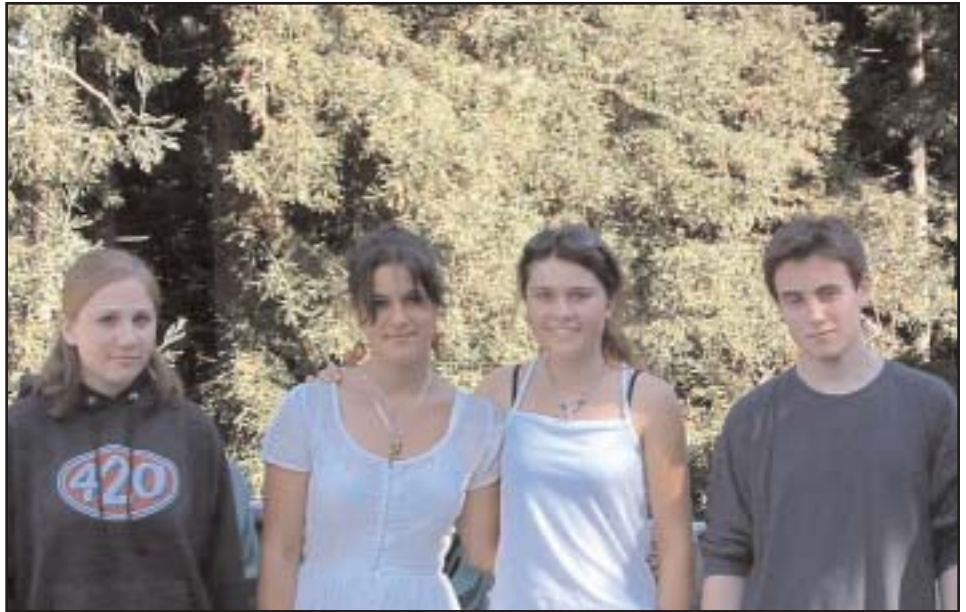
Students gather on the deck for a group portrait during the Tamiscal retreat on Mt. Tam.

Overall the purpose of the retreat was fulfilled. Students got a chance to get to know each other better, learn, be creative, work together, and have a great time doing it!