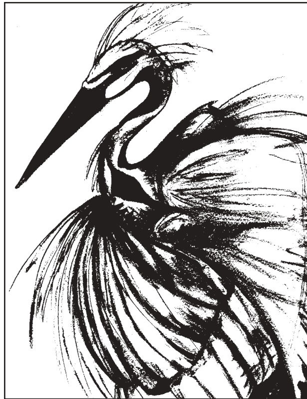
Art by Jordan Zadfar

Every purchase you make will make a difference. Register today!